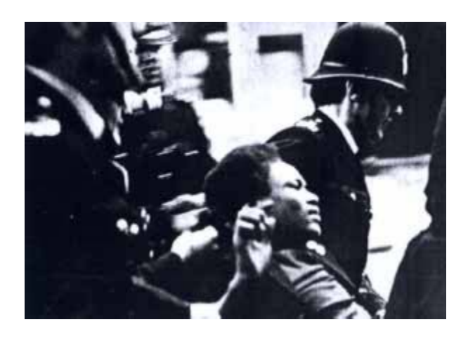
Text written by BM Blob, London, January 1993 Published by One Thousand Emotions, St. Louis, March 2006

The UK has for some time enjoyed a high level of class warfare compared to, say, the US. The readiness of its workers to strike has been referred to as "the English disease." In the 1970s this virus peaked in the '78-79 "Winter of Discontent." It resurfaced again in the Thatcher years with the '84-85 miners' strike, but the form of attack the minority of the working class that struggles there has chosen more often than not has been rioting. The 1980s witnessed two major waves of mass proletarian violence in the streets. In '81, some 80 different towns and cities saw combat. '85-86 again saw numerous incidents of looting, arson and battles with police, as well as some heavy strike action. The '90s got off to a rousing start with the Battle of Trafalgar Square, a gigantic anti-Poll Tax demonstration which leaped from protest to assault, trashing and looting the posh West End of London. The explosion tore at the heart of the British establishment - right at the doorstep of No. 10 Downing Street where Margaret Thatcher cowered in terror. She was removed from office later that year, largely due to massive non-payment of that brutal tax. The Trafalgar Square riot was 3 years ago, but as this essay shows, class war (not "Class War" [the name of a long-running UK-wide federation of anarchist groups- publisher's note]) has been ongoing. BM Blob, the authors, have written about all these struggles and more, producing a number of thick pamphlets throughout the last decade.